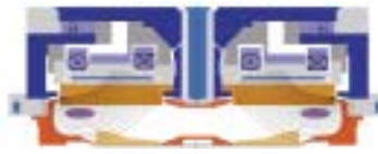
Principle of SMART CATHODE: Sputtering on Outer Diameter (B)