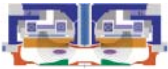
Principle of SMART CATHODE: Sputtering on Inner Diameter (A)