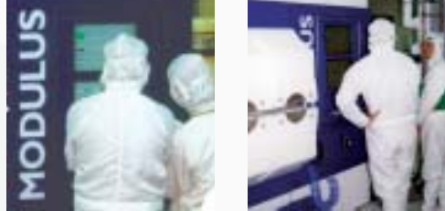
13 MODULUS installation at ITRI, Taiwan for research on future rewritable optical disc formats.