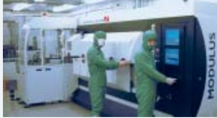
13 MODULUS installation at PIONEER, Japan, also for DVR research (Blu-ray Disc)